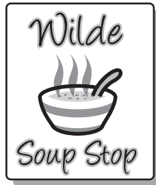
Fig.1: Existing logo for WSS